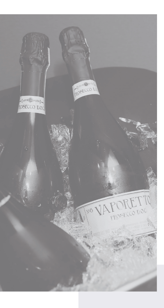
TABLE WINE SPONSOR

The Wine Sponsor puts their brand in front of every guest by sponsoring the wine at their table during the show.