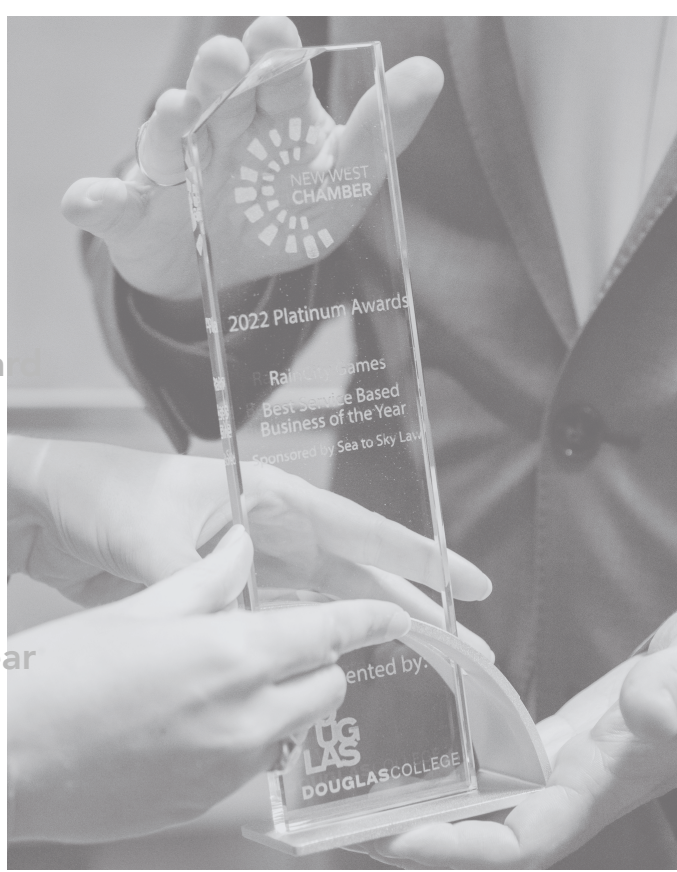
*Note: Awards are subject to change